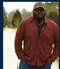
S.A. Cosby March 18, 2025