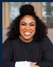
Angie Thomas April 8, 2025